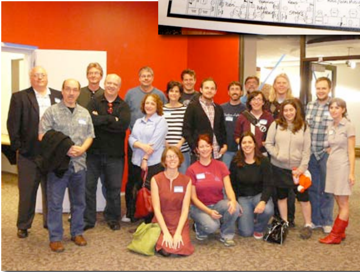
WUOG Alumni in the lobby of the new station during alumni weekend 2008.